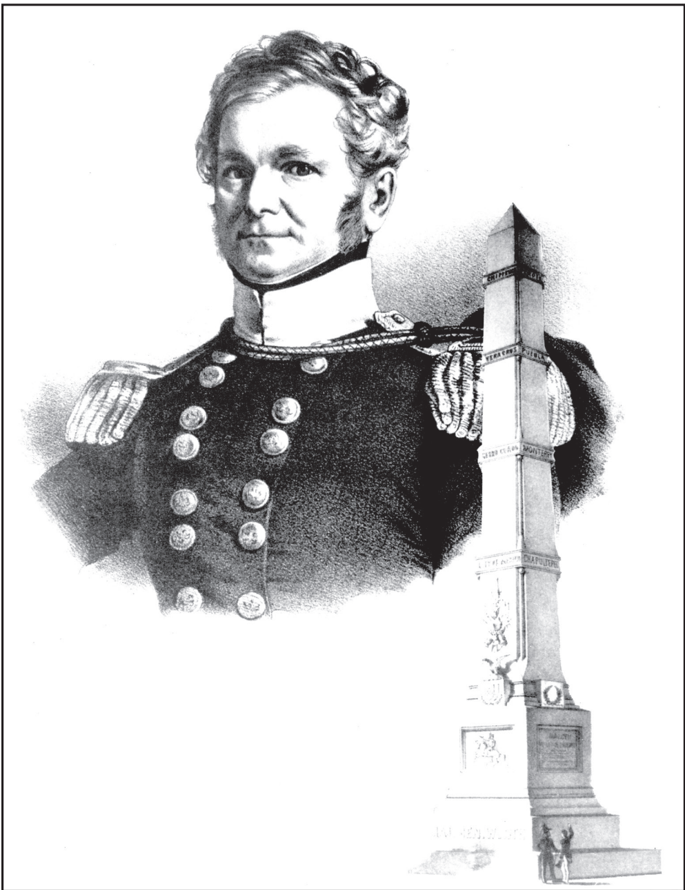
Major General William Jenkins Worth is credited with bringing the six year Second Seminole Indian War to an end on August 14, 1842. A 51 foot granite monument, honoring General Worth, stands at Broadway and fifth Avenue in New York City. It is NYC’s second oldest monument.