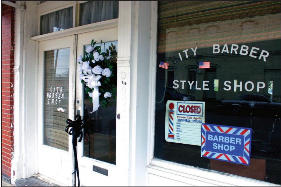
A black ribbon and floral wreath adorn the outside of City Barber Shop on Spring Street on Monday afternoon, January 23. The shop is where Zeigler cut hair for over 50 years.

Police determined at that point that the possible suspect must have known the victim as there were no signs of forced entry or burglary.