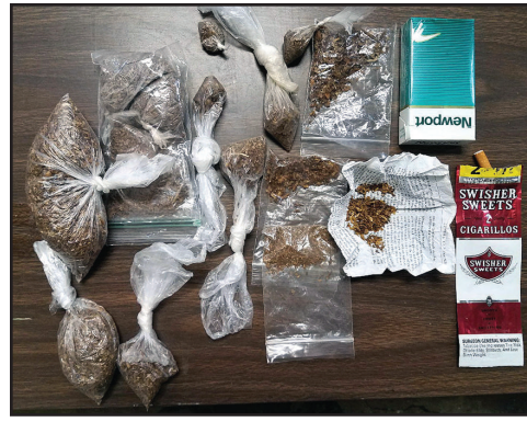
Cellular phones, tobacco and other substances were removed from inmates' cells at the Holmes-Humphreys Regional Correctional Facility in Lexington during a recent surprise "shake-down."

The event takes place at 6 p.m. in the Carroll Cafeteria