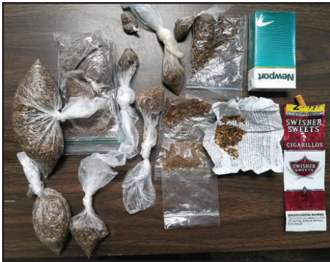
Cellular phones, tobacco and other substances were removed from inmates’ cells at the Holmes-Humphreys Regional Correctional Facility in Lexington during a recent surprise “shake-down.”

The event takes place at 6 p.m. in the Carroll Cafeteria