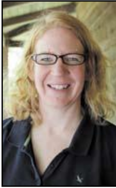
Special to The Clinton Courier

To date, there are millions of treasures, geocaches, around the world. There are 103 caches hiding within five miles of Clinton. Geocaching is a great event to get out and get active, because it combines treasure hunting, clue deciphering and can be slightly competitive when trying to find the more difficult caches. There are over a dozen different types of caches varying in size, difficulty level and contents. Geocaching was a favorite