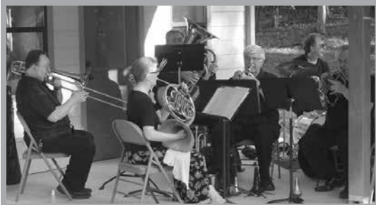
Capital Brass Band