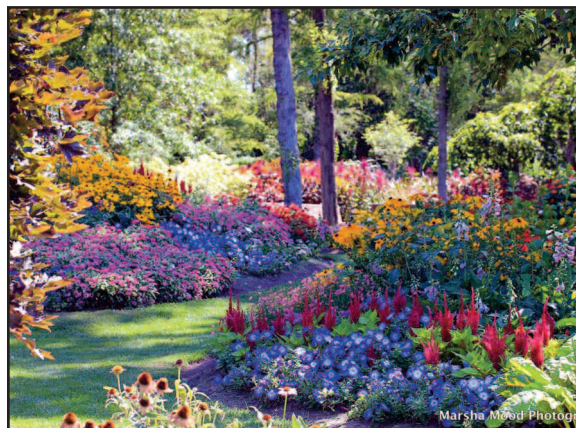
Expect stunning colors at Rotary Botanical Gardens in Janesville.

•This year's garden art display will be composed of whimsical fish mounted on a garden post. Thirty fish will be on display throughout the Gardens beginning May 15. They will then be taken down in early September and sold at a live auction on Sept. 8. Now in its eighth year, the project was developed to promote community participation and artist collaboration at the Gardens, as well as raise