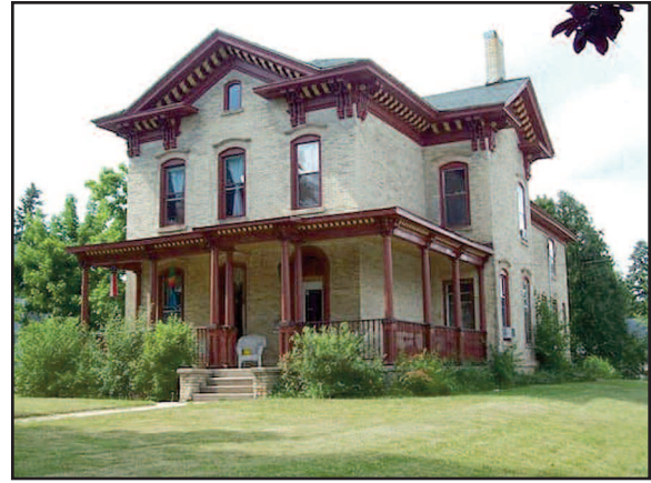
The Nelson Salisbury Home in Whitewater.

Flattered by being Wisconsin's first digital cinema drive-in, the theater's first day of business was in 1953. The venue is scattered with old-fashioned and horn-type