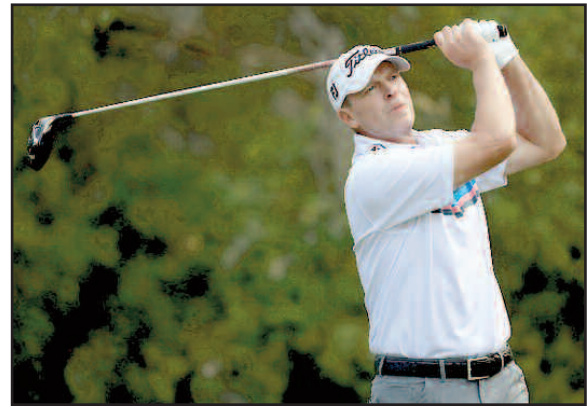
Steve Stricker tees off during the second round of the Valspar Championship at Innisbrook Resort Copperhead Course on March 10, 2017, in Palm Harbor, Fla.