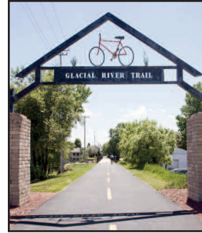
Above: Glacial River Bike Trail entrance. Below: The Family Aquatic Center.