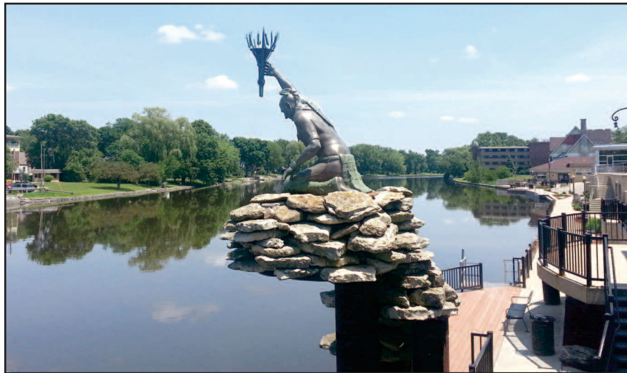
Above: The riverwalk along the Rock River. Below, left: Kayakers on the river. Below, right: Historic Koshkonong Mounds Country Club.

Skydiving, miniature golf, bowling, hiking, skiing and skating are additional family-friendly activities available to adventurers and explorers of all levels.