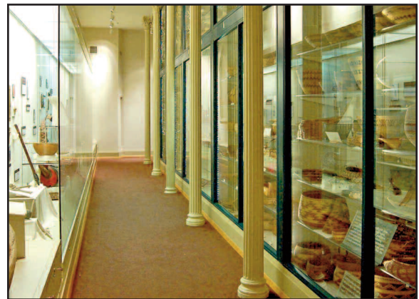
Approximately 6,000 historical objects are on display in the Logan Museum's "Cube."

The museum, located at 700 College St., is open seven days a week: Monday through Friday, from 9 a.m. until 4 p.m., Saturday from 10 a.m. to 4 p.m., and Sunday from 11 a.m. to 4 p.m. The museum's gift store, featuring handmade goods from around the world, is usually open during the museum's regular hours.