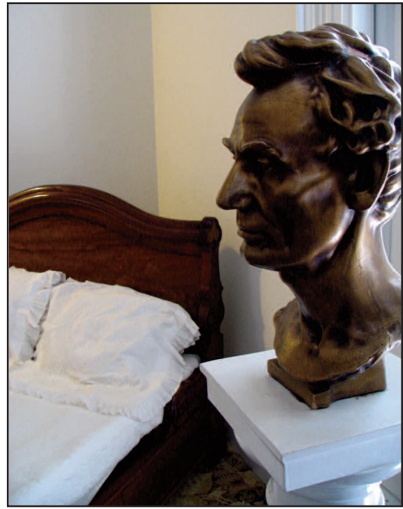
A bust of Abraham Lincoln overlooks the very bed in which Lincoln slept in the Lincoln-Tallman House for two nights in 1859. As the story goes, Lincoln was apparently quite the snorer.

Historic campus Besides the Lincoln-Tallman House and the Helen Jeffris Wood Museum, other historic structures on the RCHS's main campus (located on 3.5 acres in the 400 block of