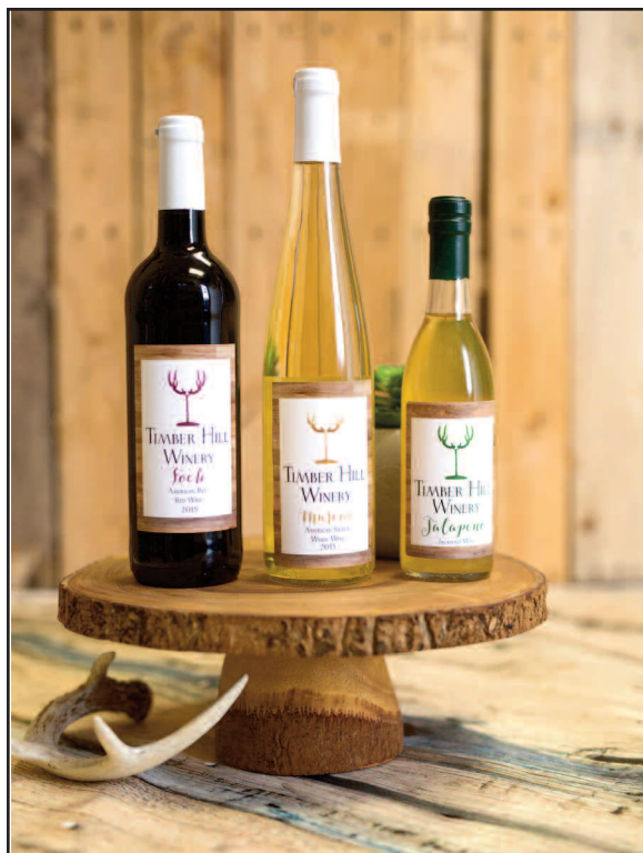
Timber Hill offers 20 varieties of wine, enough to please every palate.

To find out more about Timber Hill Winery and its upcoming events, visit www.TimberHillWinery.com or the winery's Facebook page.