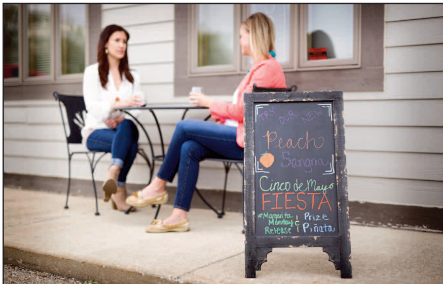
Outdoor seating is available at Timber Hill Winery, where a new patio will open this summer.

TIMBER HILL IS A FAMILY OWNED WINERY DEDICATED TO MAKING QUALITY WINES FROM COLD CLIMATE VARIETALS WITH OVER 20 WINES AVAILABLE.