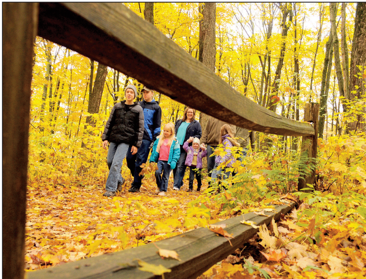
Engulfed by color, a group of people hike in Timm's Hill County Park. Timm's Hill, near Ogema, is the highest point in Wisconsin—1,951 feet above sea level. Enjoy the spectacular scenery of Wisconsin in the fall.

Earth, Wood & Fire Artists Tour: Drive the countryside to visit artist studios allowing you hands-on one-on-one opportunities to meet, mingle and learn about the art being created in rural South Central Wisconsin. A driving tour of over 20 selected fine arts and craft studios. Various locations, 10 a.m. to 5 p.m. 608-423-4507, www.earthwoodandfiretour.com