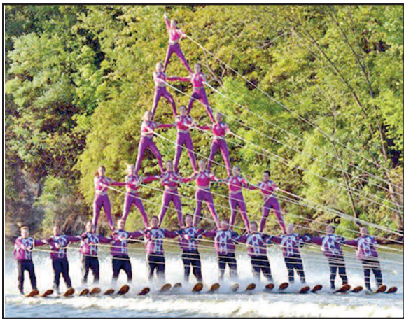
There are preposterously-posed pyramids aplenty at the Rock Aqua Jays shows on the Rock River in Janesville. (File photo)

For more information on the Aqua Jays, including a full, up-to-date schedule, visit www.rockaquajays.org .