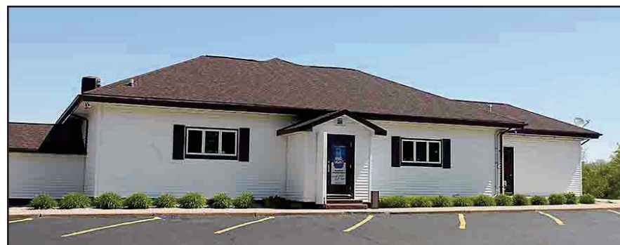
Exterior of Countryview.