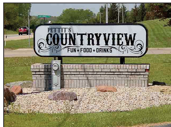
Countryview's sign along Highway 59, nicely summarizing what the establishment is all about.