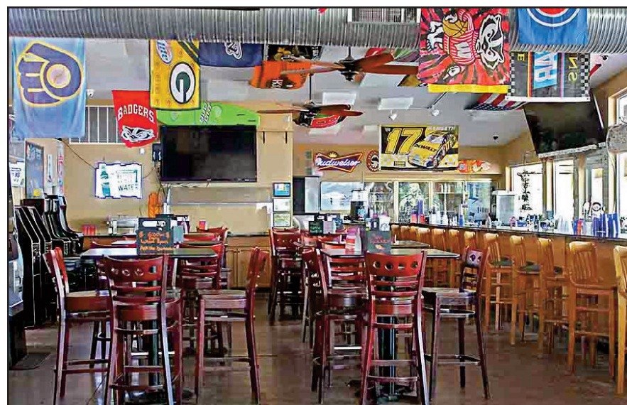
Inside the Lakeview Bar & Grill.