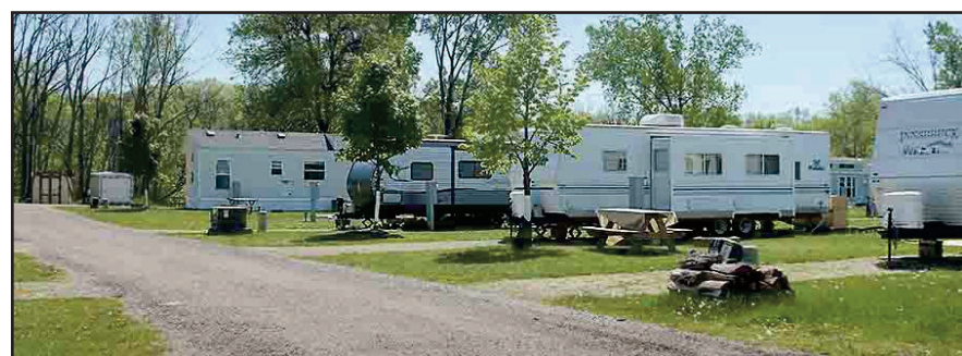
Enjoying the summer is what Lakeview Campgrounds is all about.

Countryview has volleyball leagues going Wednesdays and Thursdays with open play on the weekends. There are plans for tournaments in the future.