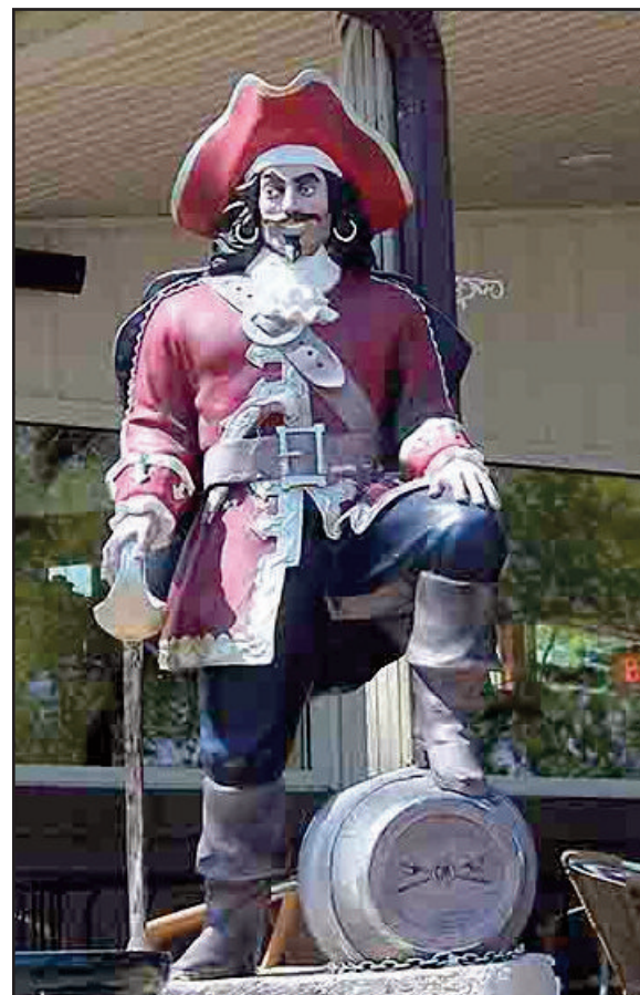
A pirate stands guard at The Lakeview Bar & Grill.