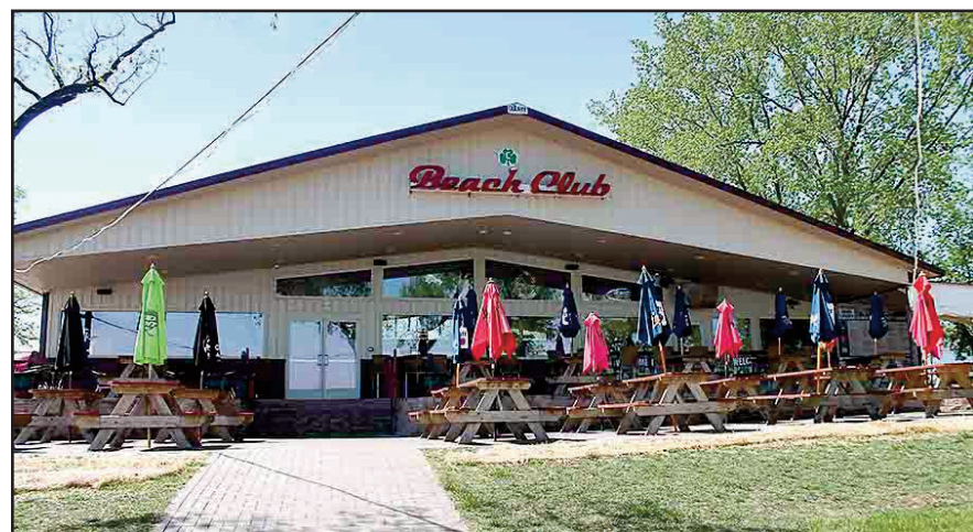
The Lakeview Bar & Grill at Lakeview Campgrounds.