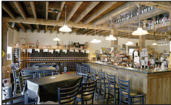
Inside Northleaf Winery's historic abode.

232 SOUTH JANESVILLE STREET MILTON WISCONSIN 53563 ~ 608-580-0575 ~ WWW.NORTHLEAFWINERY.COM