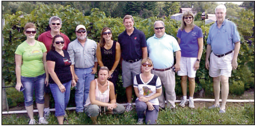
Northleaf's wine camps have become an annual popular tradition. Participants get a hands-on crash course in understanding the finer points of wine.