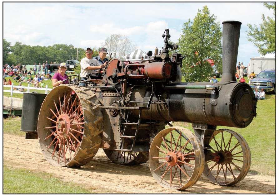
One of the antique steam tractors in a Thresheree "Parade of Power."