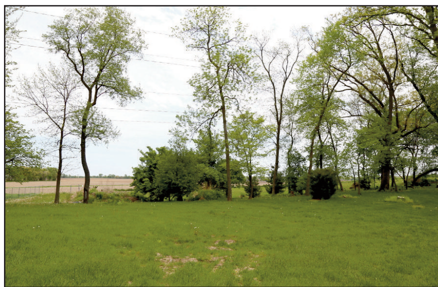
Sun-Golden Kennels offers their canine clients a three-acre, completely-fenced yard in which to romp. (Submitted photo)