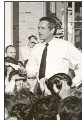
Notables appeared regularly on the Milton College campus, including musician Duke Ellington and actor Paul Newman.