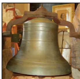
Milton College's original bell from 1855 was sold at auction in 1982; however, it was rescued and returned to Main Hall in 2015.

The original bell from the 1855 building was sold at auction in 1982; however, it was rescued and returned to Main Hall in 2015. A duplicate bell was hung in the building after the society purchased the building in 1984 and can be rung. The original is