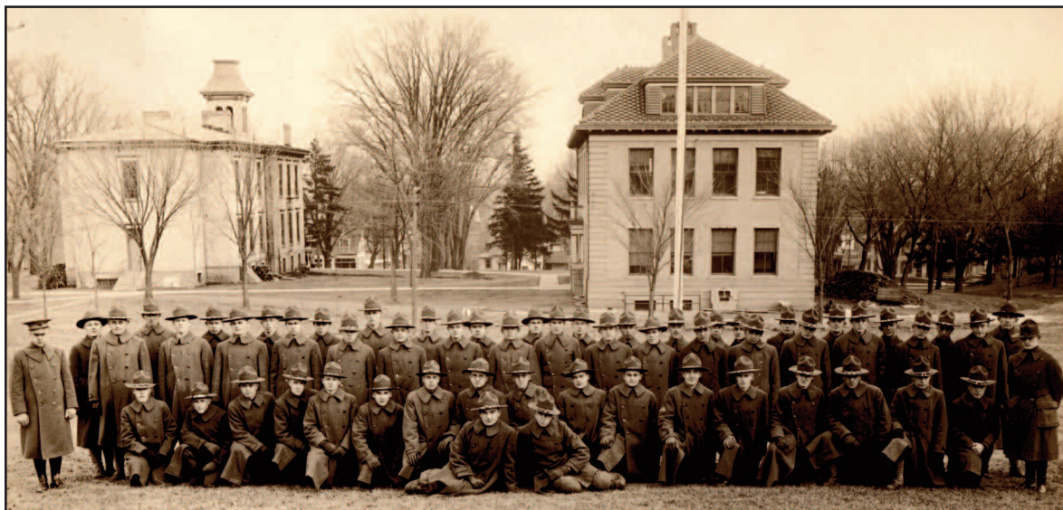
A World War I-era Student Army Training Corps (SATC) class at Milton College.

Notables appeared regularly on campus. Duke Ellington, a friend of the drama professor, played a concert and wrote two scores for Milton College dramas. Actor Paul Newman was on campus campaigning for Eugene McCarthy, while Cass Elliott of the musical group Mamas & Papas and The Kingston Trio also appeared.