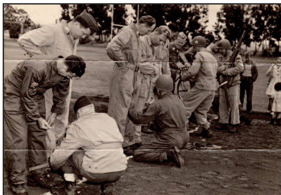
Prior to World War II, Milton College had an aviation course which trained airplane and glider pilots.

The Great Depression was a challenge for the college, but with WPA projects where the students worked off their tuitions and professors taking major cuts in salary, it survived.