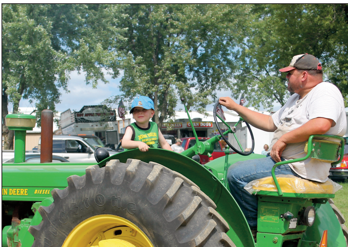
A youngster gets a tractor ride at the Rock River Thresheree. The 61st Thresheree will be held Sept. 1-4 in rural Edgerton. (File photo)

Milwaukee A la Carte: The zoo's annual food and music "feast with the beasts." More than 25 area