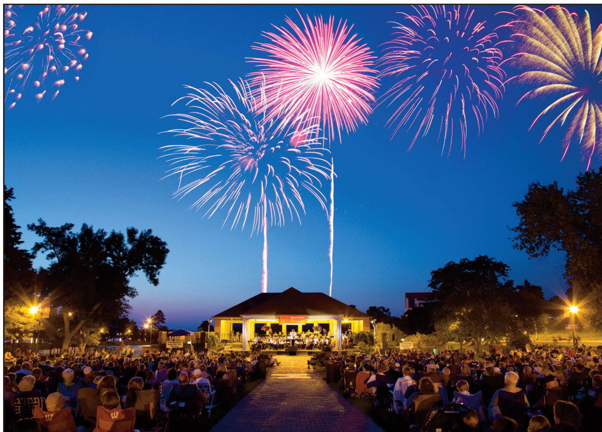
Celebrate Independence Day at Pops on the Rock at the Harry C. Moore Pavillion in Beloit's Riverside Park.

Lodi Agricultural Fair: Music, raffles, food, softball, demolition derby, tractor/truck pull, exhibits, horse pull and carnival rides. 608-592-4499, www.lodiagfair.com