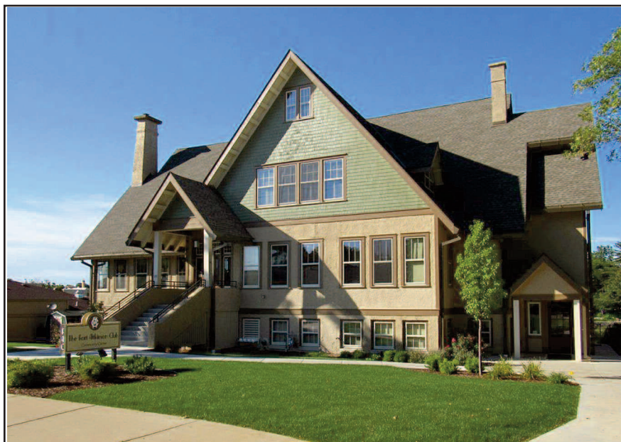
Front view of the elegant Fort Atkinson Club.

Our graceful 1912 Wisconsin Craftsman style building underwent a very tasteful renovation in 2014 and reopened in 2015, through the generosity of community donors. The former businessmen's club and Masonic lodge is listed on the Wisconsin State Register of Historic Places. We are now a self-funded community center. Members and donors help us provide a space at a reduced rate for community meetings and events such as winter Farmer's Markets, concerts, educational seminars, theatrical plays and classes in music, dance, drawing, painting and Thai Chi that are open to the public. We provide tables and chairs, a fully equipped banquet kitchen with dishes, a smaller café kitchen, two pianos, a movable stage, 70 inch computer monitors and audio-visual equipment.