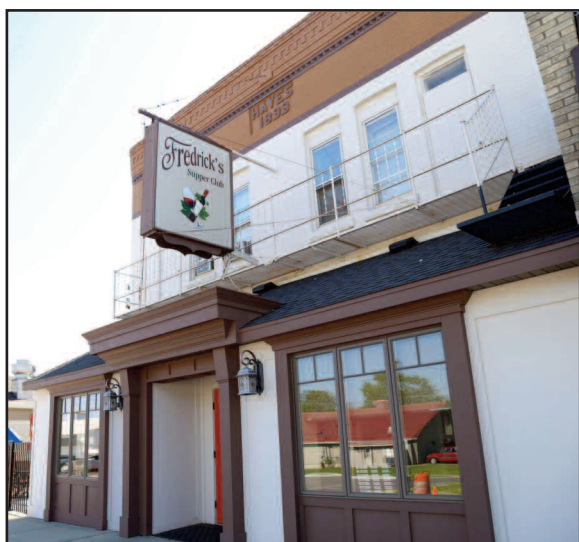
Frederick's Supper Club is located at 118 Merchant Row in Milton.