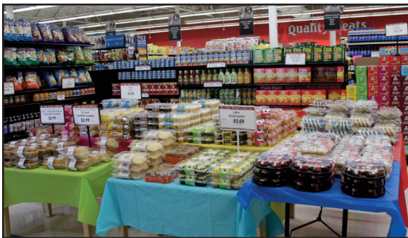
Baked goods to tempt your tastebuds at Cowley's Piggly Wiggly in Edgerton.