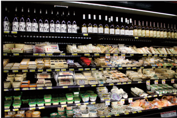
Rest assured Cowley's has you covered with extensive offerings of cheeses and other dairy products. This is Wisconsin, after all.

"Our stores wouldn't be what they are without our great staff," he says. "We feel very fortunate to have and have had such great people be a part of our Piggly Wiggly family!"