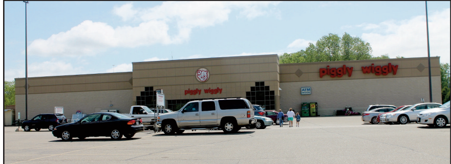
While in Edgerton, be sure to shop this Pig, located at 1211 N. Main St.