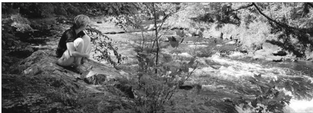
Meyers Falls on the Pine River.