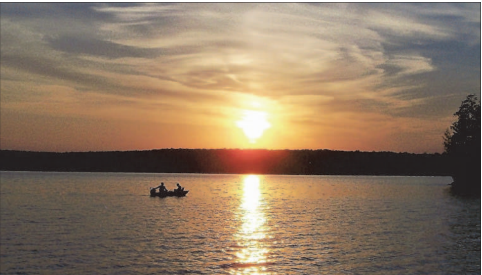
Paddlers relax on Lake Metonga along the Nicolet-Wolf River Scenic byway Hwy 55/32 in Forest County.