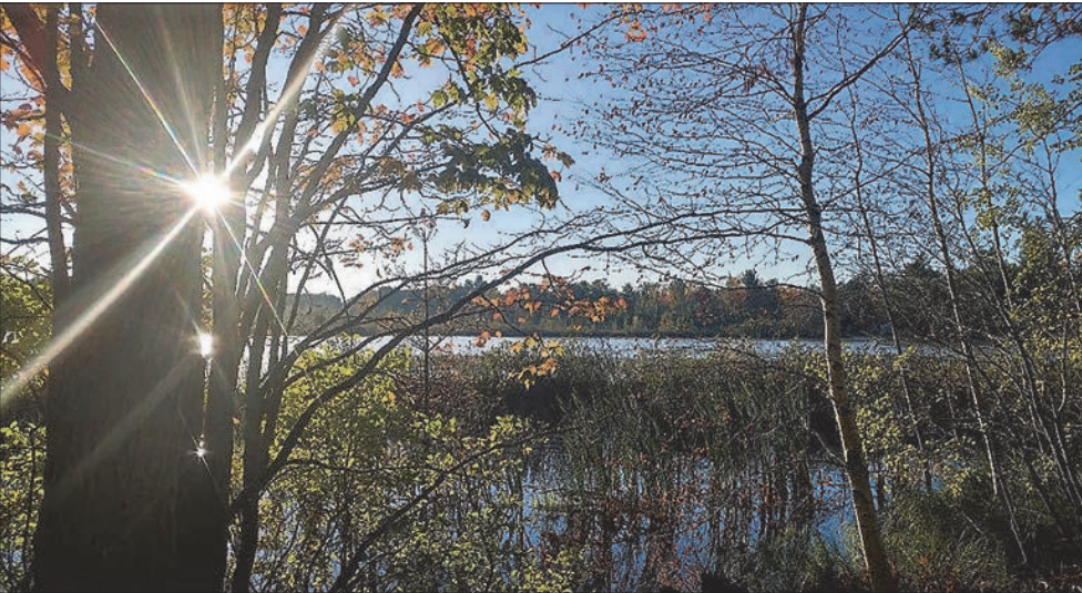
Be sure to enjoy a fall morning and get away to Mole Lake on the Nicolet-Wolf River Scenic Byway Hwy 55/32.