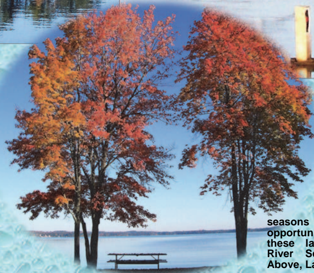
seasons of beautiful photographic opportunities. This fall, check out these lakes along the Nicolet-Wolf River Scenic Byway, Hwy 55/32. Above, Lake Metonga.