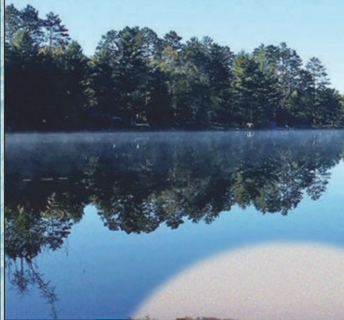
Enjoy fishing on Mole Lake in the fall on the Nicolet-Wolf River Scenic Byway Hwy 55 in Mole Lake.