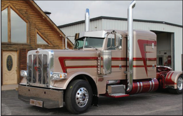
The orange truck (below) won "peoples choice" at the 4 states Chrome Shop Mafia "Guilty by Association" truck show in October. The truck above won "peoples choice" at the Super Rigs Show in May. Both shows were in Joplin Mo. and both trucks are owned by Farmers Oil Co.