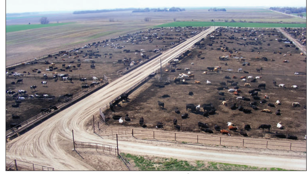
Zimm's Feedlot has continued to add infrastructure and equipment over the years to improve the operations efficiency and feed capacity. Recently a shop and storage building was added for equipment maintenance. The feedlot is located south of the Kansas Ethanol plant East of Highway 14 between Lyons and Sterling.

1650 Avenue R Sterling, Kansas 67579 (620) 278-2862