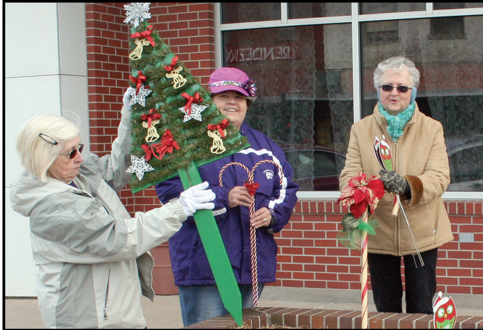
The Larned Garden Club was out on a chilly morning prepping the planters down Broadway Street for Saturday's Christmas Parade. (Reprinted from Dec. 2, 2016 issue of The Tiller & Toiler)