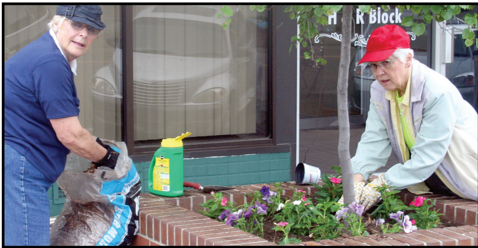
The Larned Garden Club was out in force to do their annual spring planting of the Broadway Street planters. (Reprinted from May 27, 2016 issue of The Tiller & Toiler)