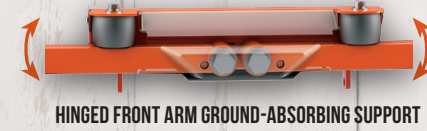
HINGED FRONT ARM GROUND-ABSORBING SUPPORT

We've thrown everything you've ever asked for into the industry-leading Outlaw XP—along with several innovations that didn't even exist on zero-turn mowers until now. The Outlaw XP is designed and built with one singular goal in mind—delivering the finest cut lawn care professionals and serious landowners demand. There's literally no innovation or patented feature we've developed that's not represented on the XP. And it delivers years of use with the speed, power and comfort a Bad Boy Mower has become known for. The Outlaw XP sets the bar for every other commercial mower out there, packing more innovation and performance—and all for a better value.