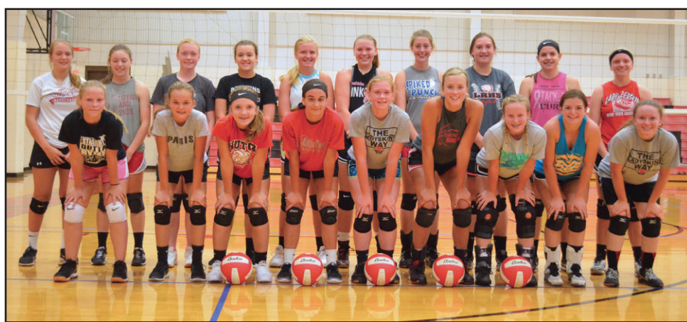
2017 Little River Lady Redskin volleyball team

Little River opens the season on the road at Centre before welcoming Bennington and Wakefield in weeks two and three.