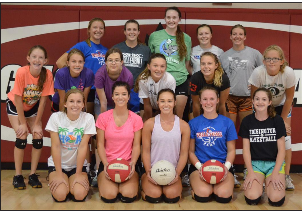
2017 Hoisington Lady Cardinal volleyball team