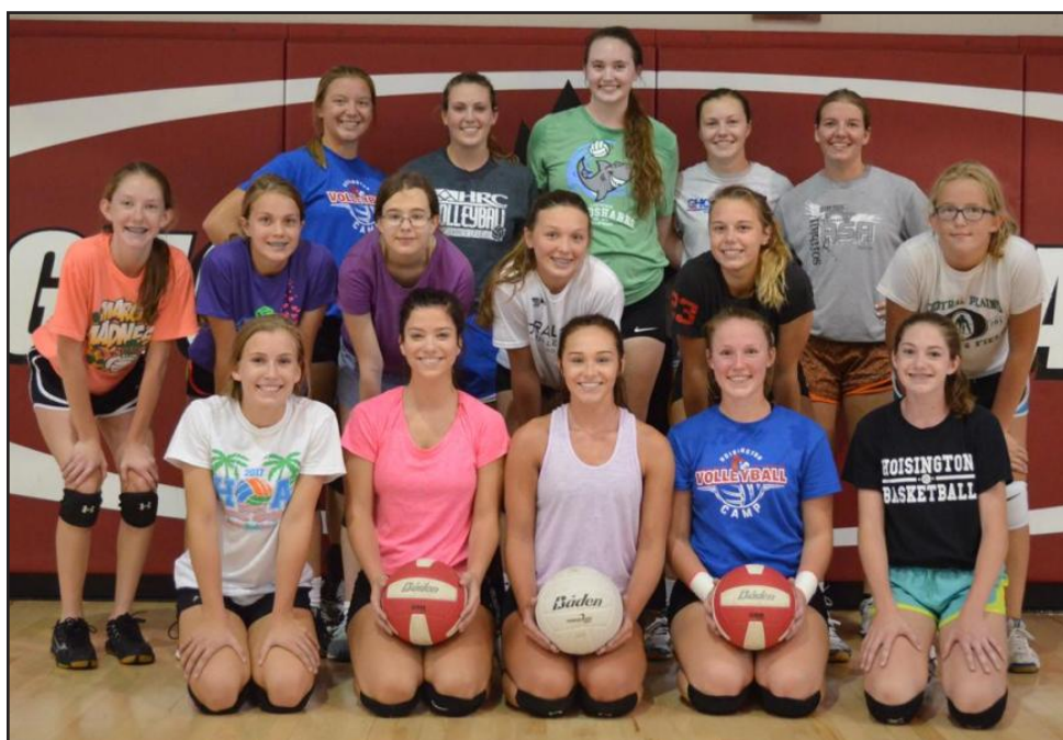
2017 Hoisington Lady Cardinal volleyball team