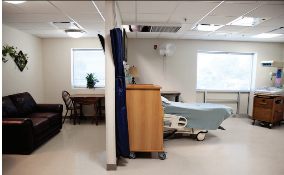
RECENTLY REMODELED BIRTHING SUITES offer comfortable accommodations for Mom, her new baby and family.