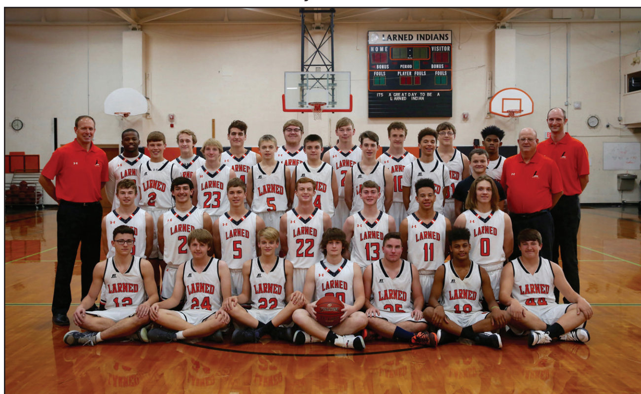
2017-18 Larned Indian basketball team

took over a senior-laden program with no returning starters and very little varsity experience. The Indians battled through a tough Central Kansas League to finish 1-9, and 4-17 overall.