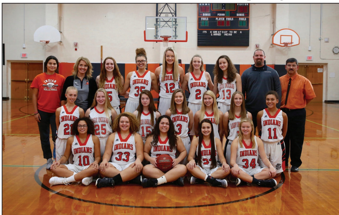
2017-18 Larned Lady Indian basketball team