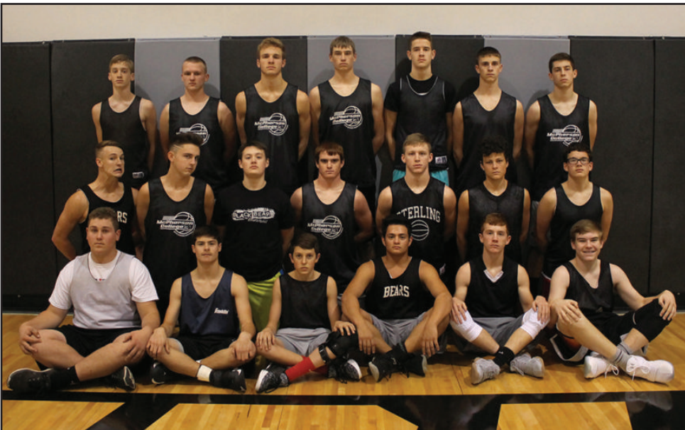
2017-18 Sterling Black Bears