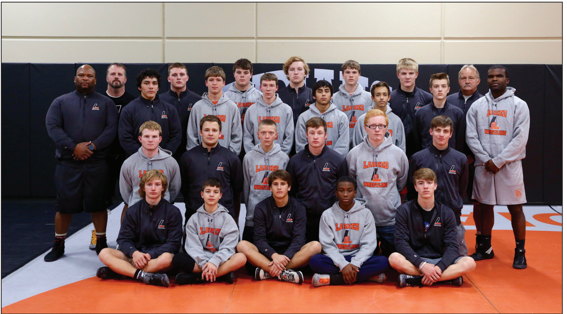
2017-18 Larned Indian wrestling team