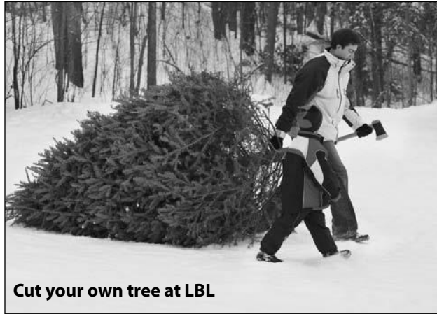
Cut your own tree at LBL

A permit allows the cutting of one cedar tree less than 10 feet (3 meters) tall anywhere except within sight of the U.S. 68-Ken-