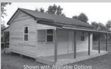
Shown with Available Options