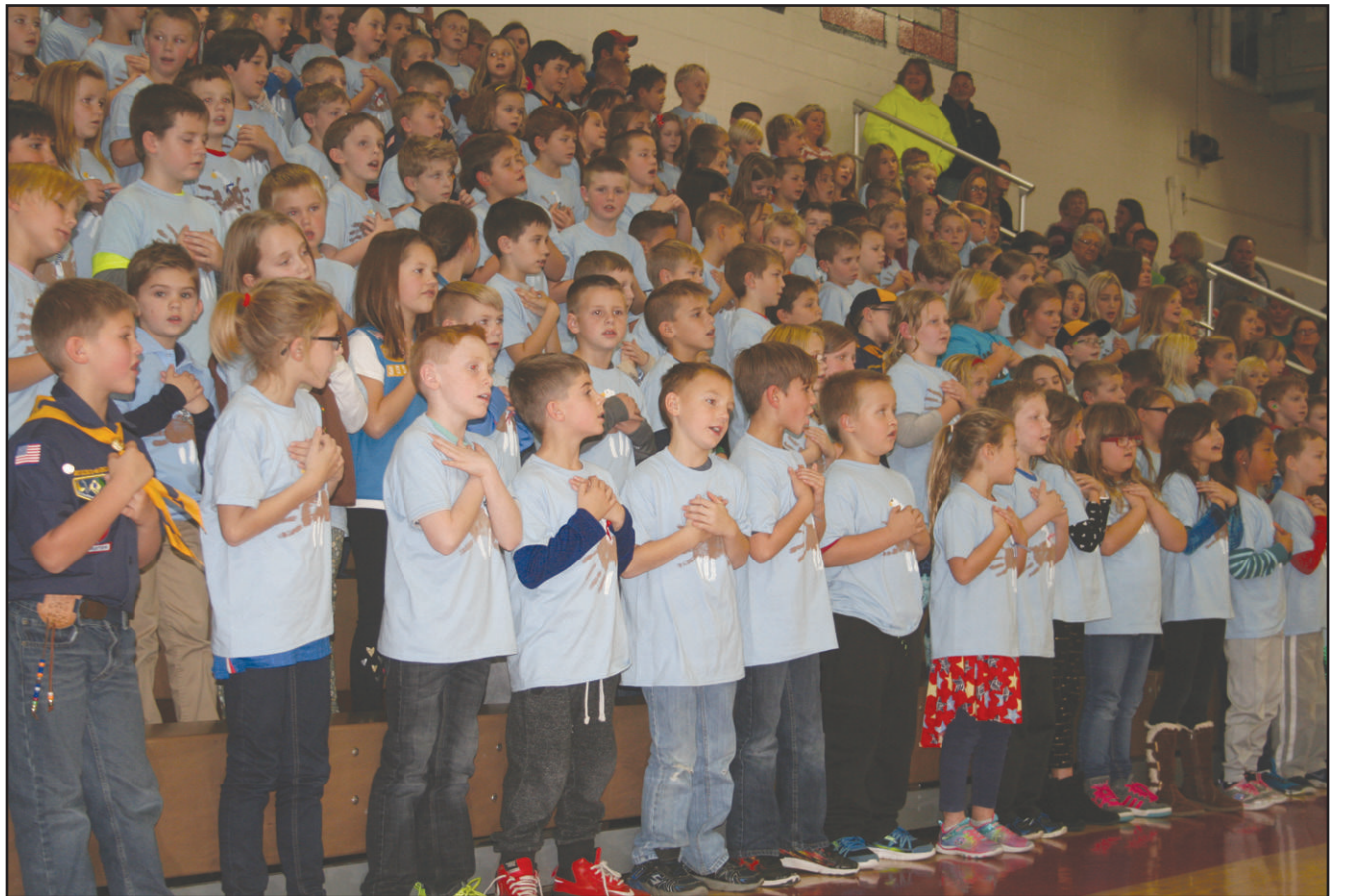
Second graders perform a patriotic song during the Veteran's Day program held at Mt. Zion Grade last Friday afternoon.

Proceeds from this month's Mt. Zion Chamber of Commerce luncheon were donated to the Mt. Zion Community Children's Christmas Fund. Every