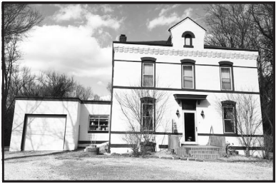
609 W. College, Greenville Price Reduced! Historic Home On 3 Acres! 3 Bed 3 Bath $195,000