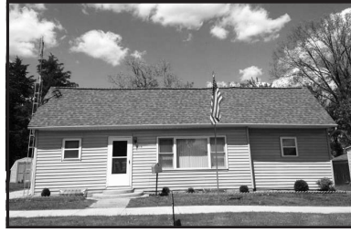
919 E Washington, Greenville Priced to Sell! 2 Bed 1 Bath Home Nice Yard & Det Garage $50,000