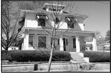
211 E Main, Greenville Great Investment! Move in Ready Home w/4 Apartments $229,900