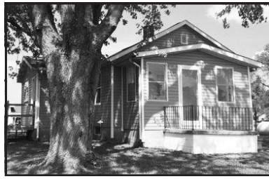
1017 Main St, Old Ripley Just Listed! Recently Updated Home Move in Ready! 2 Bed 1 Bath $47,500