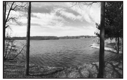
xxx Stowe Ave, Greenville 2+ Acre Governor Bond Lake Lot! Beautiful Building Site $149,900