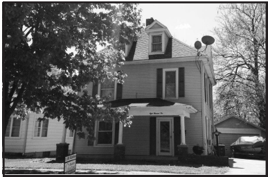
802 E. College, Greenville Price Reduced! 4 Bed 2 Bath Detached Garage $69,900