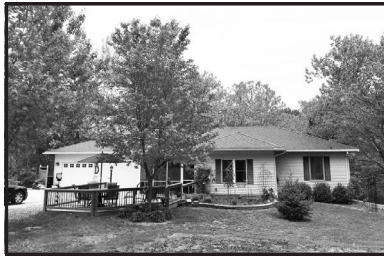
126 Quail Hollow Greenville Just Listed! Quality Built Home Full Walkout Basement $298,000