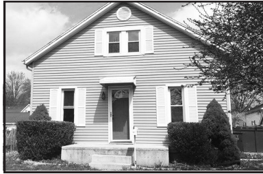
603 E Washington, Greenville Great First Home! 3 Bed 1 Bath Basement & Fenced Yard $69,900