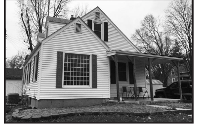
505 Charles, Greenville Motivated Seller! Price Reduced! Move in Ready! 3 Bedroom $52,000