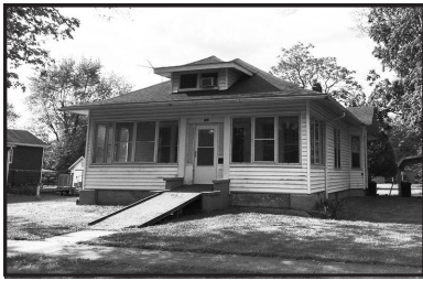
304 E South, Greenville Just Listed! 3 Bed 1 Bath on Corner Lot Full Basement & Carport $68,000