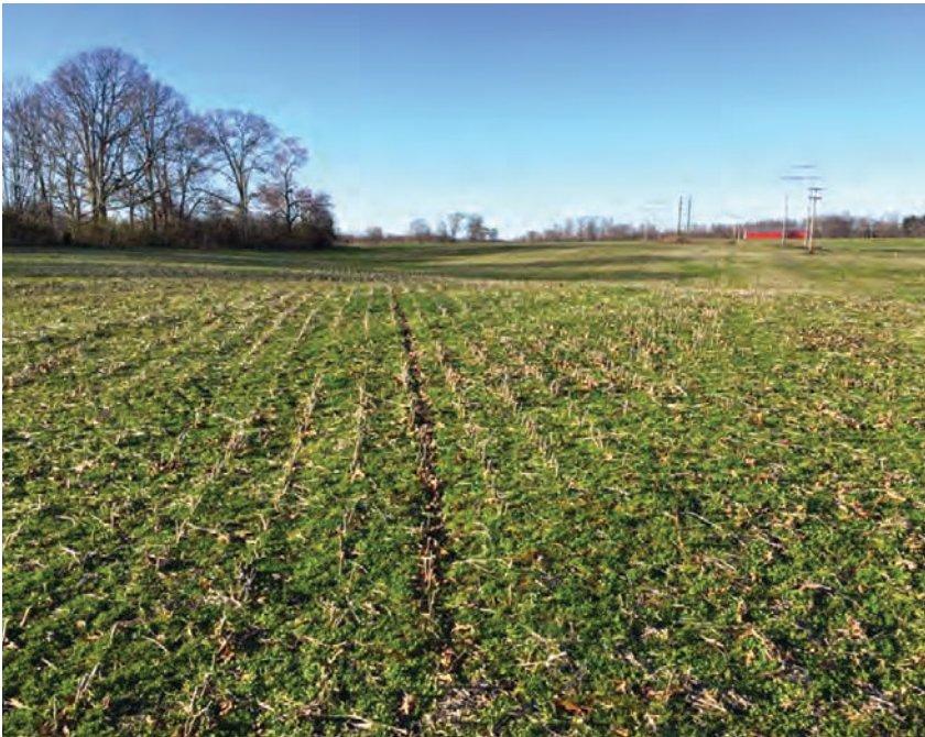
This field has been earmarked as the future home of a soccer field to serve the county's teams.

If you build it, they will come. The field of dreams in this case is for soccer, as land has been purchased that will someday be the home to Tigers and Saints, hopefully sooner than later. The 6.2 acres where the soccer field is located is off Allen's Ferry next to the Little League Baseball fields. Other locations were considered including a site by Northside but they eventually settled on the field that is located near their present practice field. The soccer teams currently use the high school football field for their home games and share a common practice field.