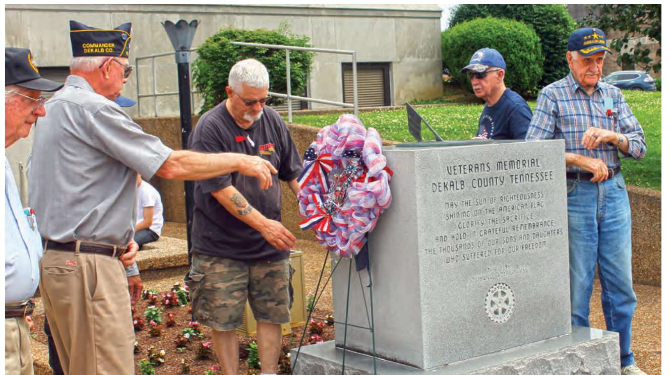
Members of the American Legion Post 122 place a wreath at the Veterans Memorial downtown in front of the DeKalb County Courthouse as part of Memorial Day observances in Smithville.