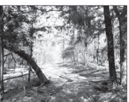
Tract No. 1 has 7.4 acres +/- with good level sitting and has well casing with concrete pad for water. This tract has good building

Tract No. 2 has 76.7 acres +/- with beautiful building sites with great views. This tract also has a large pond that is over a half acre in size and some good marketable timber with long road frontage on Anderson Road. We reserve the right to regroup both tracts.