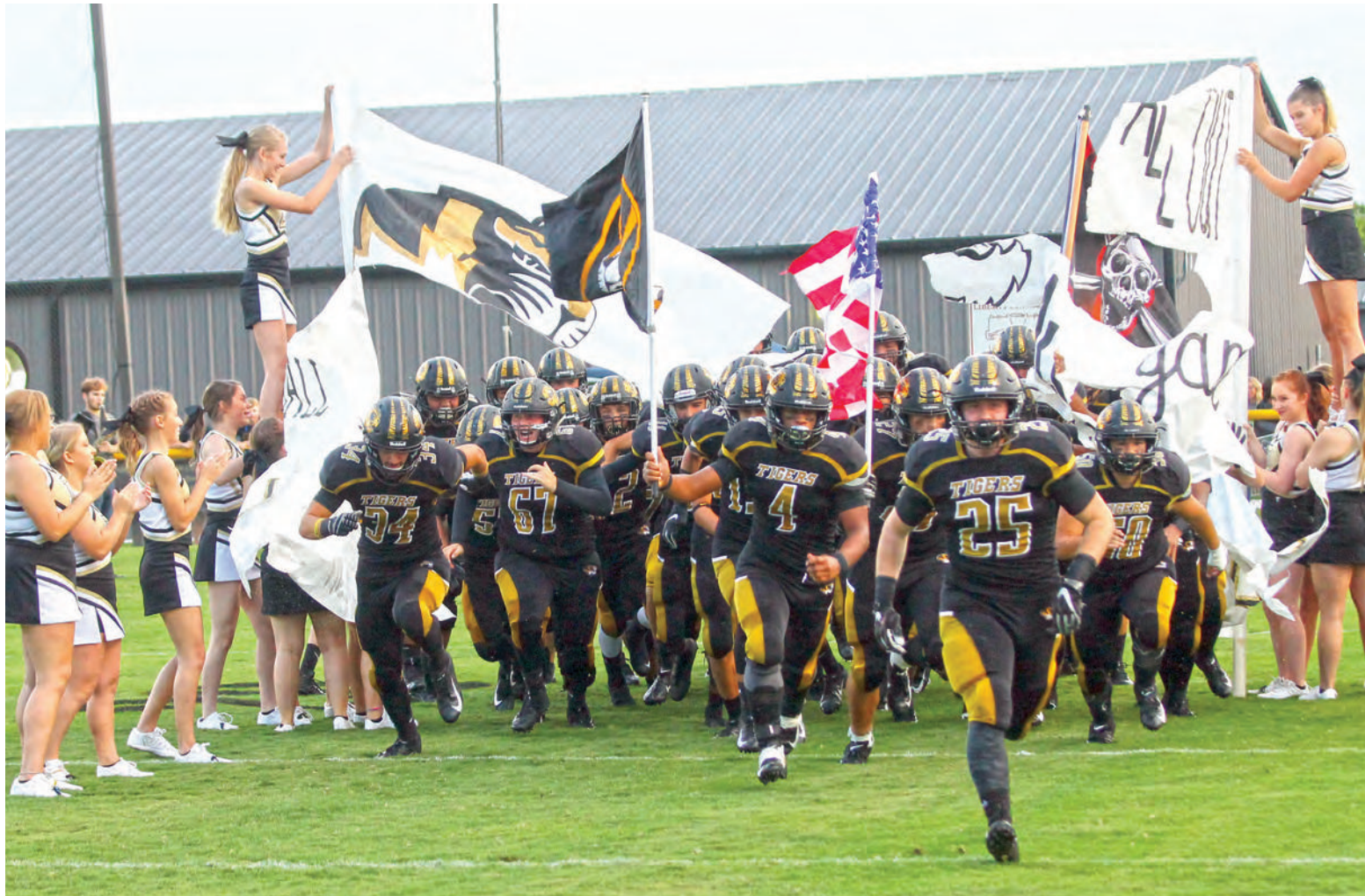
The DeKalb County Tigers charged onto the field Friday night, kicking off the 2018 football season with 19-14 win over the rival Warren County Pioneers in their annual border battle. They play host to Upperman this Friday.