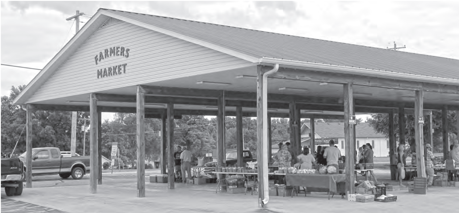
The Farmers Market is a popular destination for locally sourced foods. The market is open on Saturdays and is located next to the county complex in Smithville.