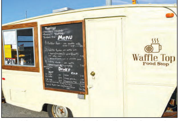
Waffle Top, a new food trailer, is located at Three Star Mall and boasts a 98 on its Health Department score.

"You can pay $20 and set up for the day," said Monica. "The $100 is for people who don't want to haul their stuff back and