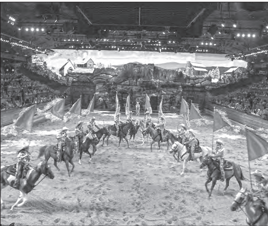
She's no longer whistling Dixie. Dolly Parton has dropped "Dixie" from the name of her popular Pigeon Forge horse show attraction.