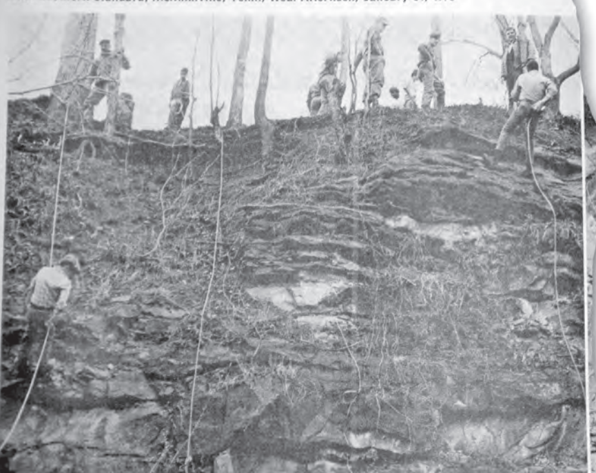
LONG WAY DOWN —Members of the 42nd Civil Affairs Company gave boys scout leaders watch from