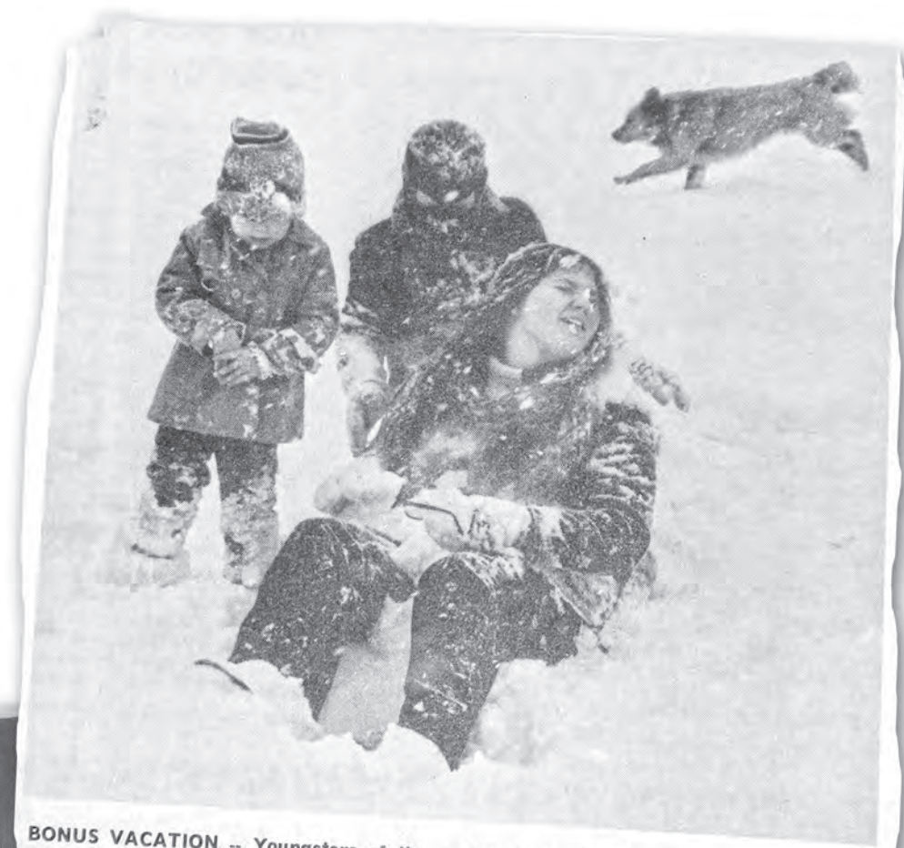
BONUS VACATION — Youngsters of the area who got a "bonus" vacation due to the snow this past week took advantage of the situation to get in some sliding on everything from conventional Christmas