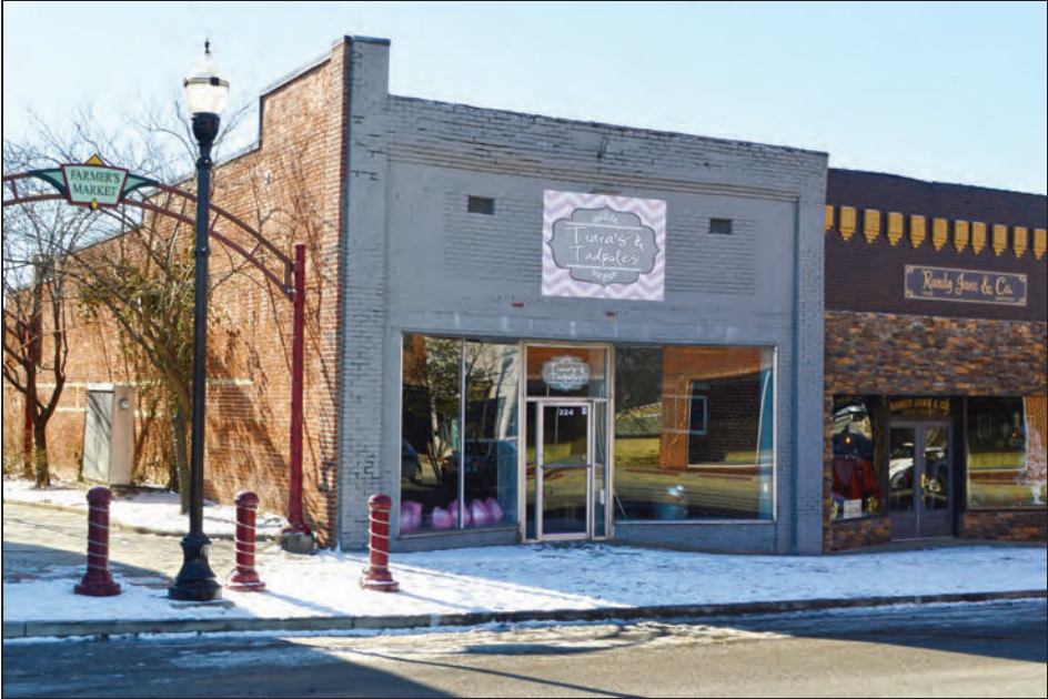
The building at 224 East Main Street that was formerly Tiara's & Tadpoles has been sold. According to county records, the deal was finalized Tuesday.